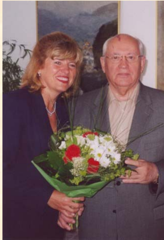
M. S. Gorbachow 2002