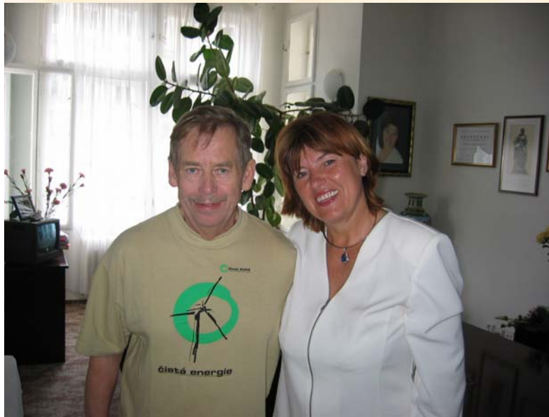
President Václav Havel 2000, 2004