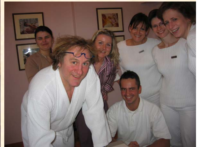
Gérard Depardieu 2005