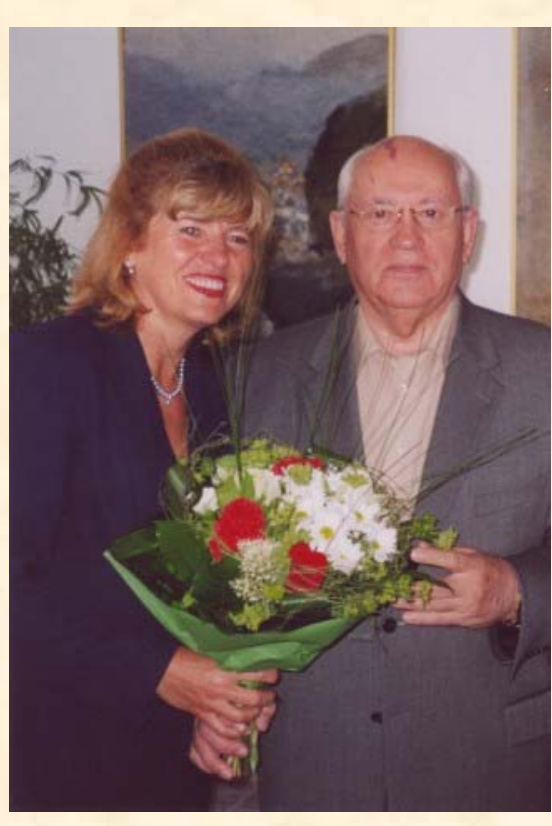
M. S. Gorbatchow 2002